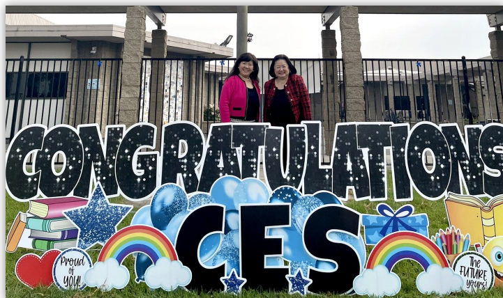
On December 1 Cerritos ES held their Flag Raising Ceremony to celebrate this award.