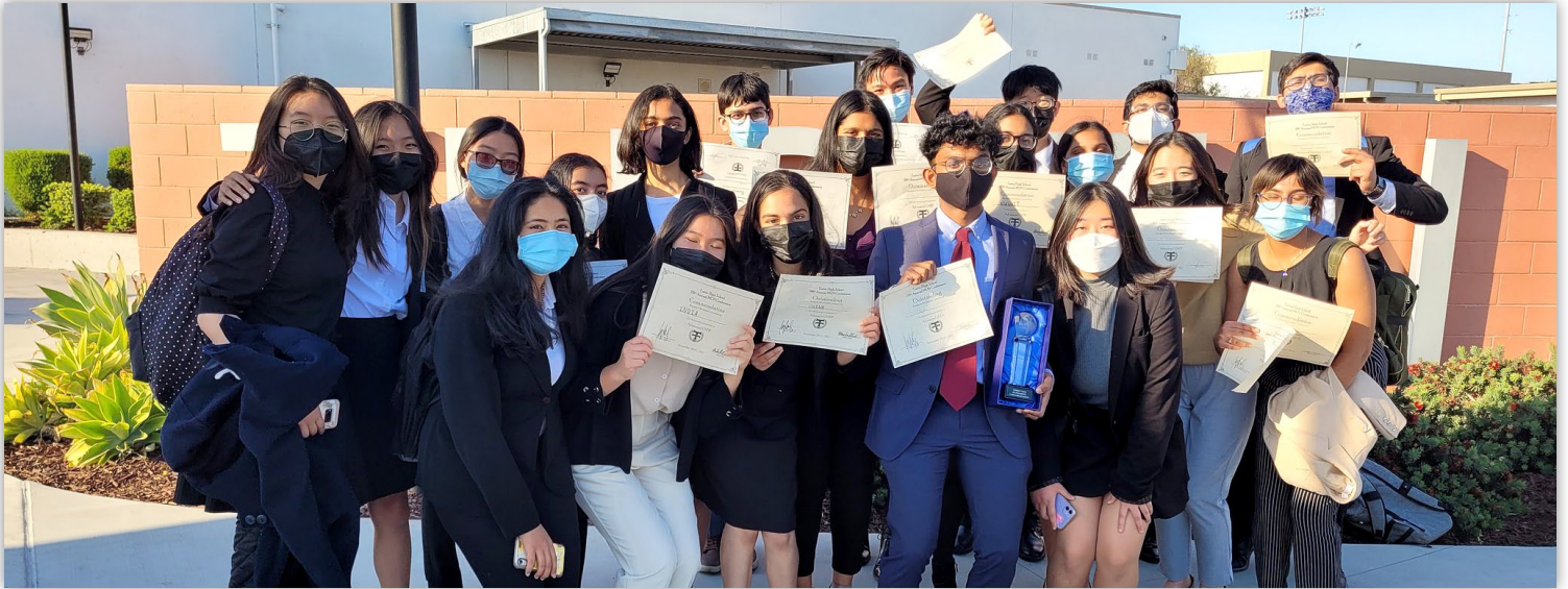
Whitney HS Model United Nations team won Best Large Delegation last month at the MUN Conference at Tustin High School.