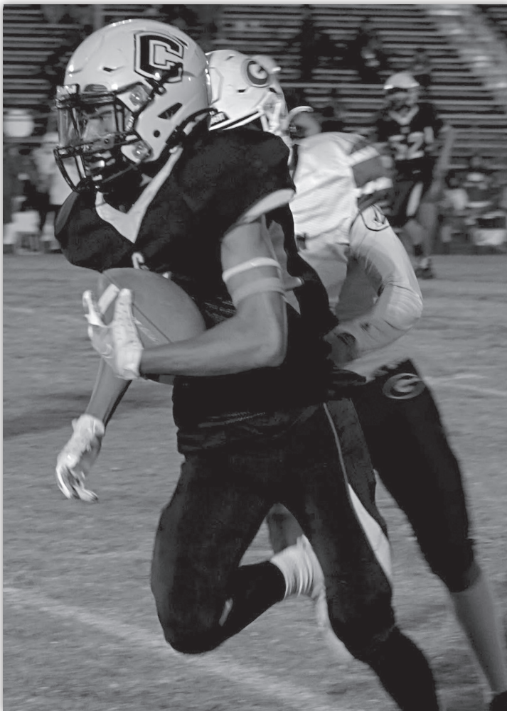
Cerritos HS wins 1 st place in the 605 Football League. The varsity team advanced to the CIF playoffs for the first time in two decades.