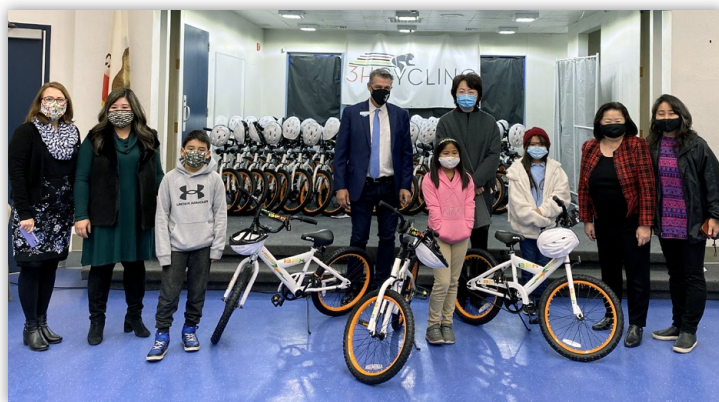
All Aloha ES 3 rd grade students received their bikes!

The BK Program offers all third graders at selected sites an opportunity to participate in an essay contest describing how a bike will help them make their community a better place. In preparation the Velo Allegro Cycling Club, the YMCA, the ABC Special Programs team, and other community volunteers work together to assemble over 50 bicycles for students. The students do not know that in addition to the winning essays, every third-grade student wins a bike. Students are individually fitted with a new bike to embark on the road to a healthy lifestyle. ▶